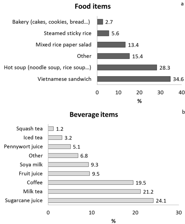
Fig. 2: The percentage of consumption survey of street foods in Can Tho city (a) Food items (b) Beverage items (n = 410)

of beverages for relaxation. Khairuzzaman et al. 27 reported that fresh sugarcane juice with ice was sold by hawkers in the streets and other similar public places making it easy to find and consume.