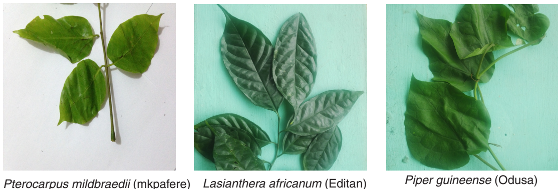
Fig. 1 : Edible vegetables used for the study

and general well-being where the preparations are to contain extracts of Pterocarpus mildbraedii and/ or Lasianthera africanum . The high tannin content however, reduced on heating (Table 1). At 50°C for 5 minutes, percentage reductions were 9.1%, 6.1% and 35.1%, and 90°C for 15 minutes, 53.4%, 25.0% and 51.9% for Pterocarpus mildbraedii , Lasianthera africanum and Piper guineense respectively. Highest reduction of the anti-nutrient occurred at 90°C for 15 minutes for all vegetables. This is in line with results obtained by Lola (2009) who reported tannin content reduction of non-conventional vegetables to the minimum when boiled.