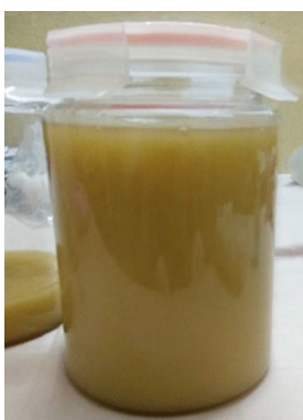
Fig.3: Fresh honey