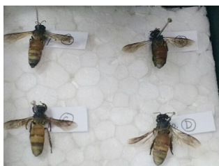
Fig.1: Honey bees specimen

As per Ayurveda , the Puttika bees are big in size and yellowish in color, 27 which lives inside hollows of big trees. Thus, the characteristics found in the sample of honey bees, are similar to Apis dorsata as per the characteristics described in Ayurveda and the report of the entomologist. The physical characteristics of the honey samples were also the same as the characteristics of honey produced by Puttika honey bees as the color and consistency of honey was similar to ghee.