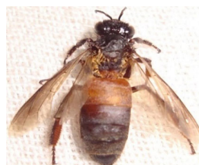
Fig.2: Honey bee ( Apis dorsata )