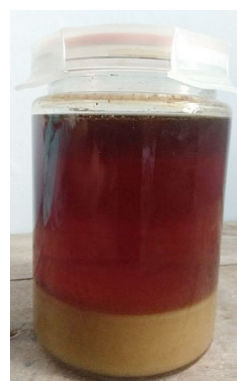
Fig.4: Old honey