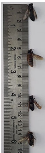
Fig.5: Size of honey bees

Thus, researchers have determined that the collected honey was Puttika type of honey on the basis of similarity of characteristics of honey as well as sample honey bee (Figure 1,2,3,4 & 5).