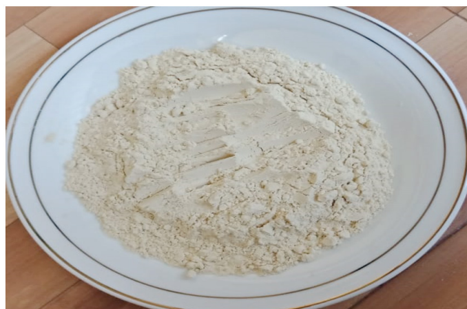
Fig. 1: Foxtail Millet Flour

Despite the fact that foxtail millet and flying fish are abundant in West Sulawesi province, people remain under-utilized as a food source. It is only traditionally managed and did not extend to the entire community. Especially for flying fish which has a short shelf life and the quality of this food may be decreased depending on water content. 13 In addition, the production of flying fish does not exist at any time due to the influence of seasonal changes. As a results, people in the communities are rarely consumed this food. Therefore, a powdering process for this food may be a good way to maintain