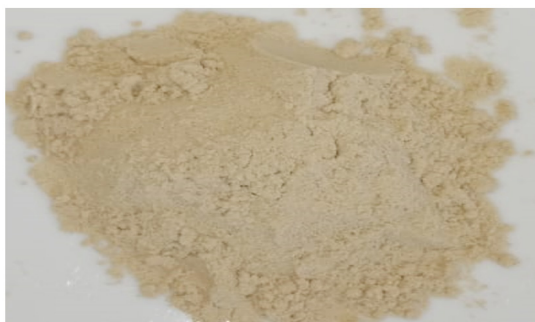
Fig. 2: Flying Fish Flour

The chemicals used for proximate analysis were aquadest (H 2 O), sodium hydroxide, selenium, cuprum sulfate (CuSO 4 ), red methyl indicator, sodium sulfate, indicator, hydrochloric acid 001 N, hydrochloric acid 3%, acid nitrate concentrated, sodium tetra borate, selenium catalyst, iodide kalium solution (KI 20%), sulfuric acid solution, boric acid solution 2%, SeO 2 , 25% K 2 SO 4 , NaOH 30%, H 2 SO 4 25%, H 2 SO 4 1.25%, sodium thiosulfate solution