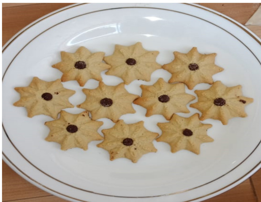
Fig. 3: Cookies Biscuit F3

The measurement of the total fat content carried out by the Soxhlet method is the direct extraction of free fat with non-polar solvents using the Soxhlet tool.